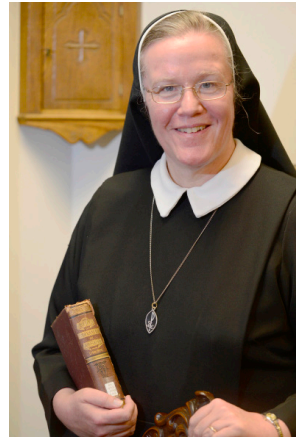
"Thoughts from a Catholic Evangelist"

As I drove her to the senior center, I held her hand, cried and laughed with her. When we arrived at our destination, I